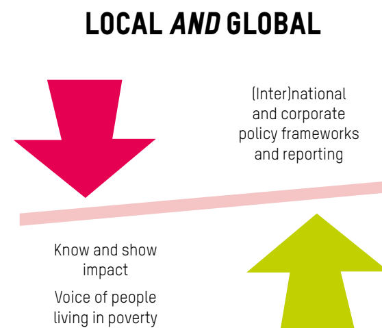
FIGURE 2 - LOCAL AND GLOBAL

We will work local and global on various pressure points, as indicated in Figure 2 below, working at both ends of civil society influence spheres on the corporate sector: on the side of the consumers, international frameworks, standards and reporting on the one hand; and on the side of communities, right holders and stakeholders on the other (see Chapter 5 for specific activities), while aiming to know and show the relationship between these sides.